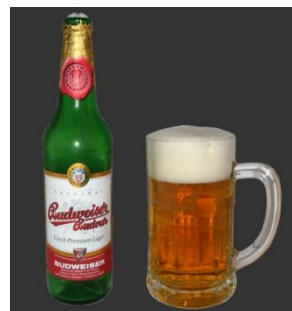
Beer or any Kind of Alcohol

This document was developed with funding from the Bureau of Population, Refugees, and Migration, United States Department of State, but does not necessarily represent the policy of that agency and the reader should not assume endorsement by the federal government.